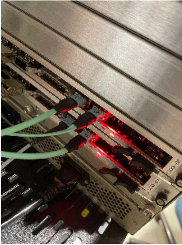
Image of connections on the RTM data side. The non-marked fiber is the type-B fiber which comes out from the breakout box.

Use connectors with yellow strip (they seem to work best). Slow control channels have been tested to be working if placed in this configuration