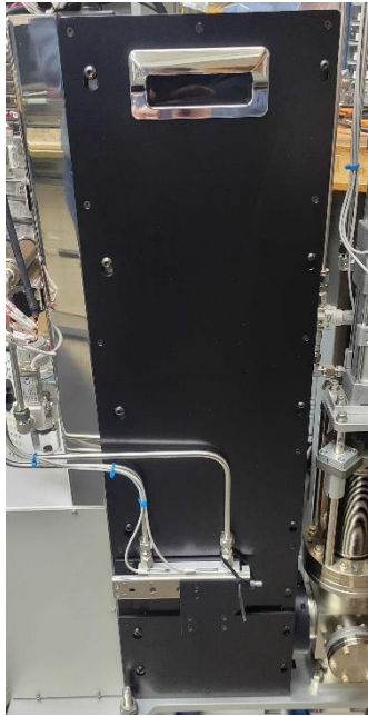
Figure 3 : PAL Device Back, Secondary Camera/Filter Access