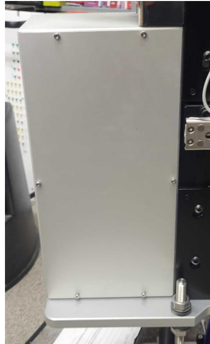
Figure 4 : PAL Device I/O Box