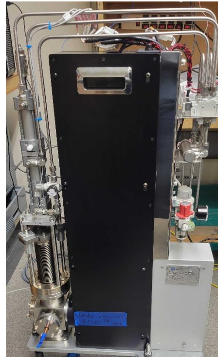
Figure 2 : PAL Device Front, Main Camera/Filter Access