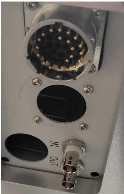
Figure 5 : PAL Device Cable Connection