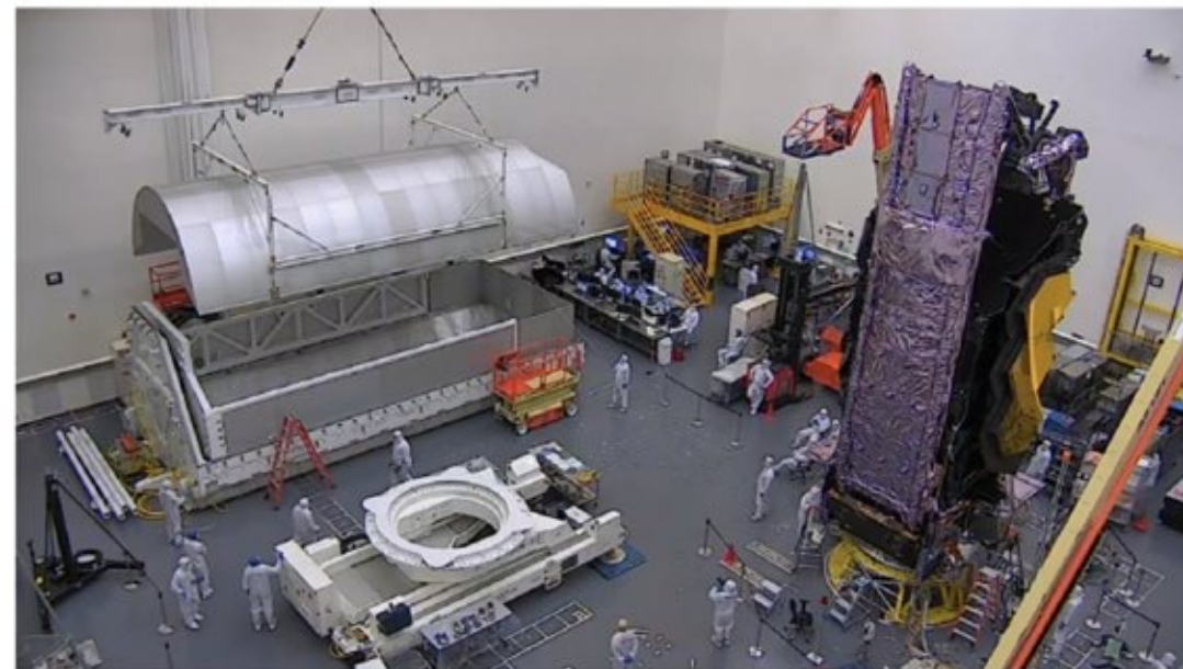
Shipping container, roll-over fixture and Webb at Northrop Grumman