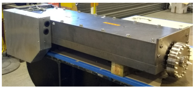
Figure 3: Spreader septum.

The spreader septum is a Lambertson type septum magnet, with a circular profile field free region and a 3" wide pole. Due to the 15 mm maximum separation of the kicked and un-kicked beams leaving little space for a vacuum chamber, the spreader septum requires an in-vacuum pole. The spreader septum has engineering name 0.625SD38.98, having a dipole gap of 0.625" and a core length of 38.98". A picture of the septum is seen in Fig. 3. The design parameters for the 0.625SD38.98, sufficient for up to 10 GeV of the HXR and SXR beams, are given in Table 1.