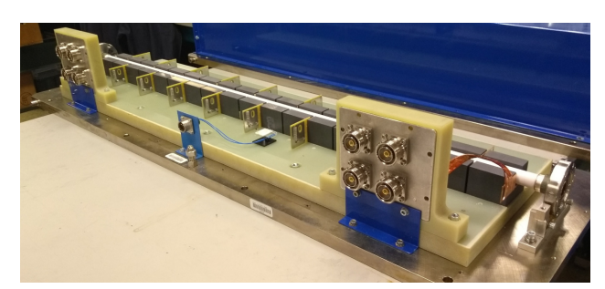
Figure 2: Kicker magnet with cover and top busbar removed.

To achieve the required integrated field, three 1 m long kicker magnets, each providing 4 mT-m, are pulsed simultaneously. Each kicker section is composed of 18 gapped ferrite blocks arranged to enclose a ceramic beampipe as shown in Fig. 2.