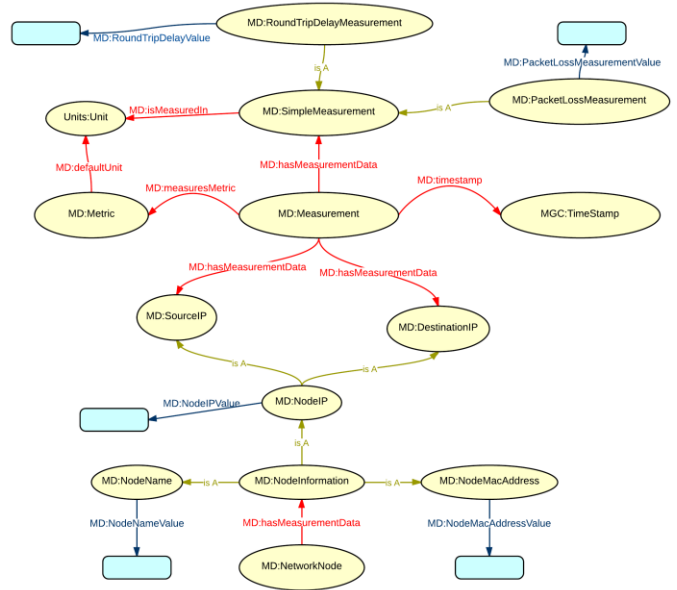
Figure 2 - Proposal of MOMENT ontology for the PingER domain

[18], which produced a Measurement Ontology 7 for IP (MOI) traffic, that is an European Telecommunications Standards Institute (ETSI) Group Specification [19].