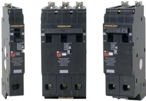
ECB-G3 Series Bolt-on remotely operated circuit breakers