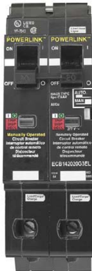
Square D® Powerlink® ECB-G3EL Circuit Breaker for Emergency Lighting Circuits

Identifying the proper controls for a lighting system can be a daunting task. Cost, space considerations, energy codes, desired operation, and National Electrical Code® (NEC) code compliance must all be considered when specifying a system. Often, controls for emergency lighting systems are also required which further compounds the complexity of the control system.