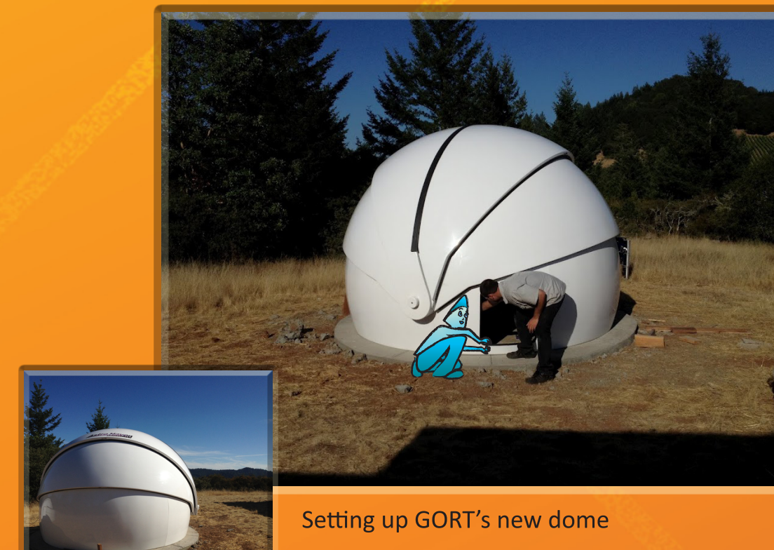
Setting up GORT's new dome