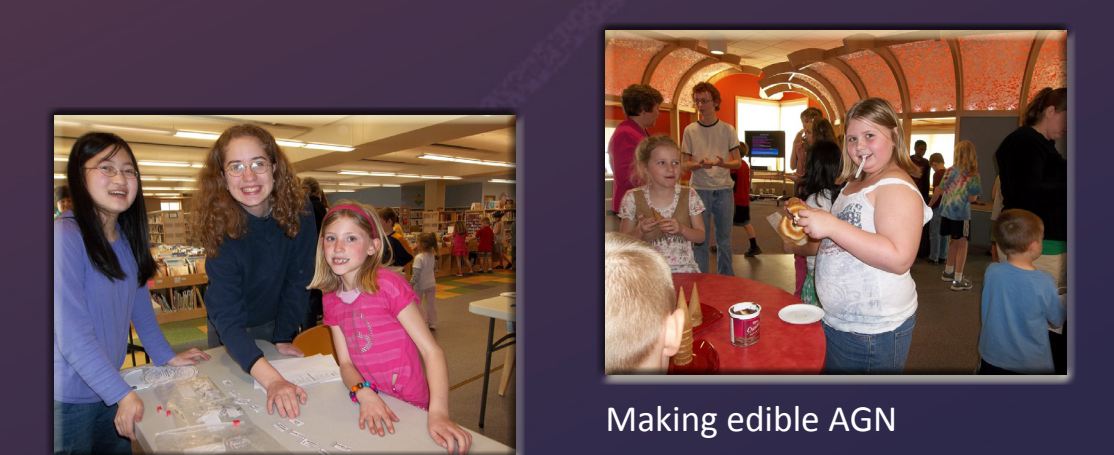
Scale the Universe activity

Two Fermi Educator Ambassadors participated during 2011 in this new program, which is reaching girls through workshops held at public libraries.