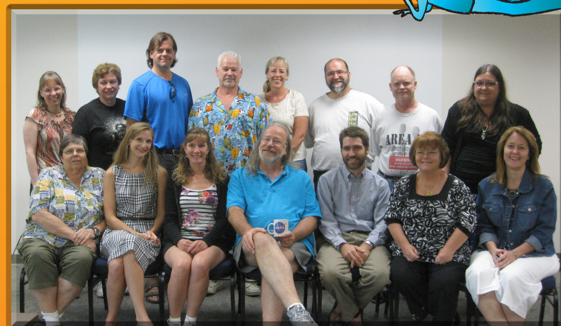
Educator Ambassador 2012 Team

Master teachers who are trained by SSU E/PO staff and who in turn, train other teachers. Over 57,000 teachers have been trained since 2002 through this program.