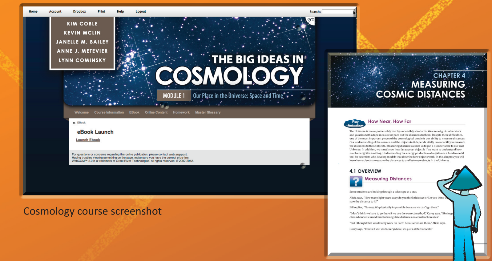
Cosmology course screenshot

Fermi E/PO is supporting the development of an online curriculum for college students: "The Big Ideas in Cosmology."